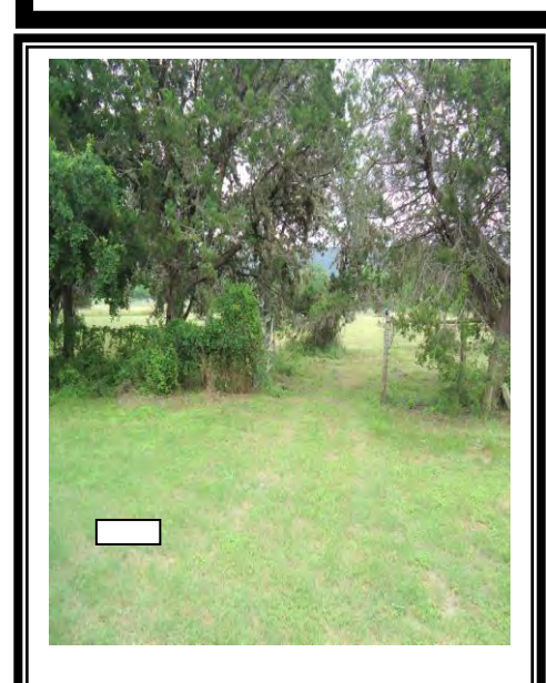
REAL ESTATE IS OUR BUSINESS..... OUR ONLY BUSINESS!