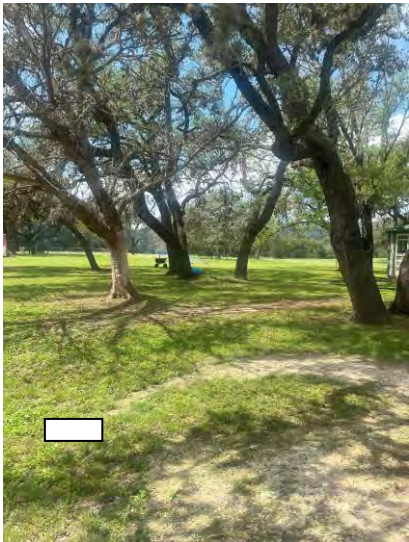
REAL ESTATE IS OUR BUSINESS..... OUR ONLY BUSINESS!